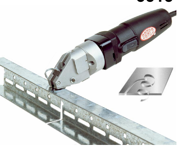
Dry wall Metal stud / UA-profiles